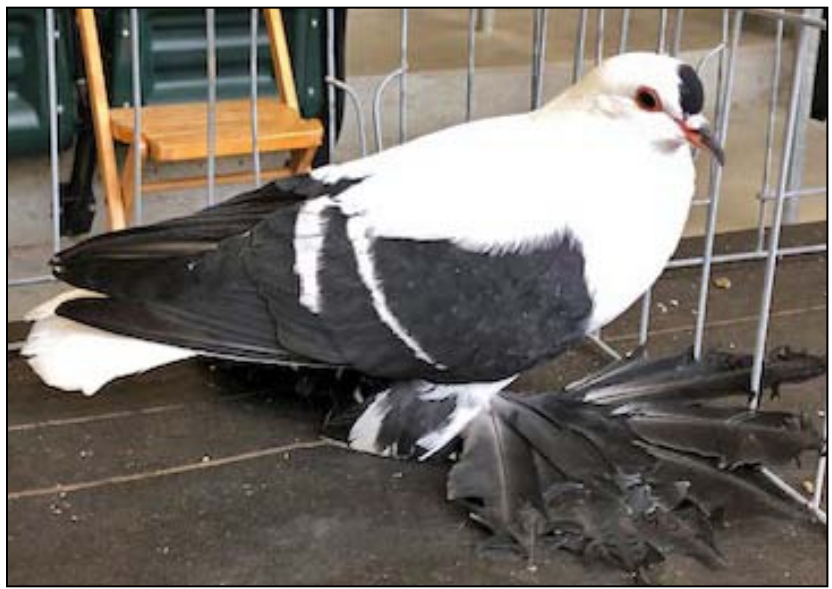
Champion Swallow, Best Silesian Swallow Black white bar YC #1204 - Jim Grober