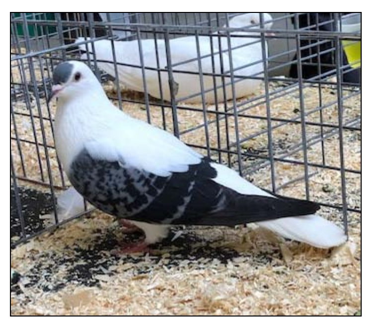
Best Thuringer Wing Pigeon, blue check OH #86; Elliot Yeske