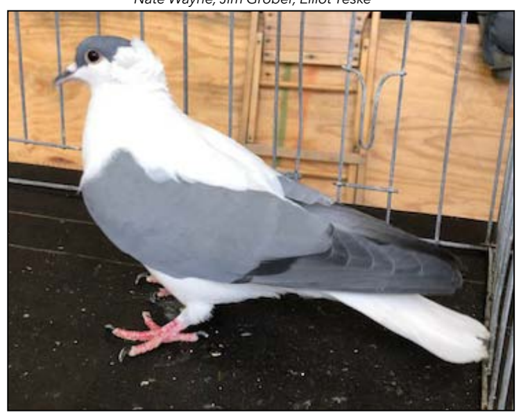
Best Thuringer Swallow blue barless YH #67; Elliot Yeske