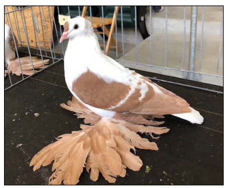
Best Saxon Wing Pigeon; yellow white bar YC # 811 Nate Wayne