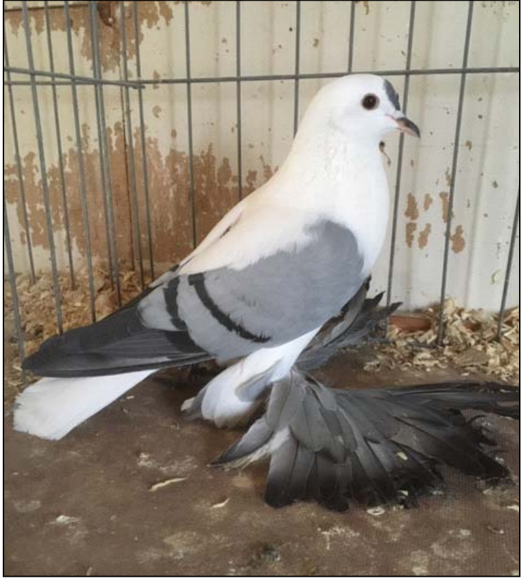
Res. Champion, Best Silesian, Blue Black Bar, YC #1445 Rated S95; Steve Ripper