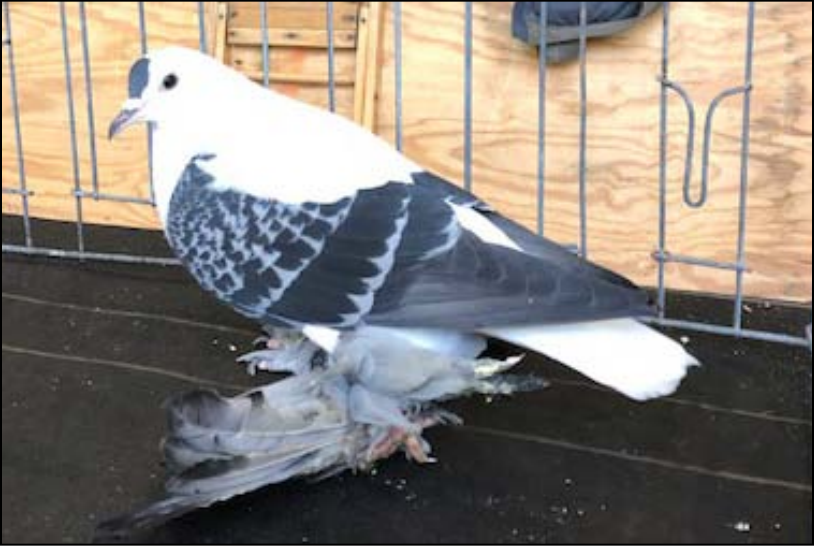
Reserve Champion, Blue Check - Old Cock Rated S95 #2330 Kaylee Quattelbaum